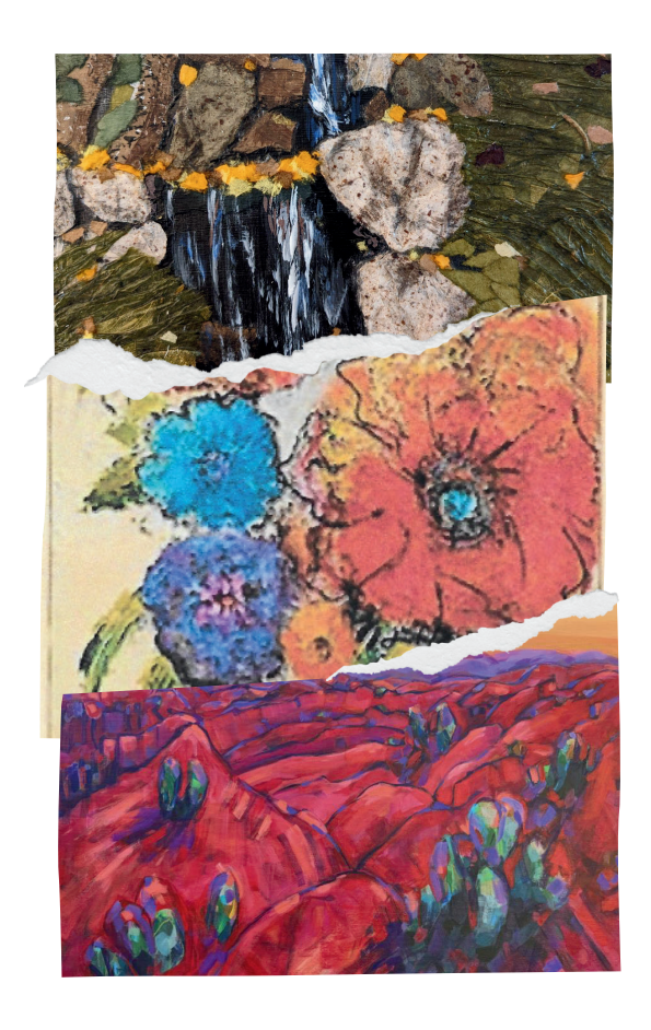
Thursday, January 23rd, 2025 3:00 - 4:30 PM

San Diego Oasis 17170 Bernardo Center Drive San Diego, CA 921283