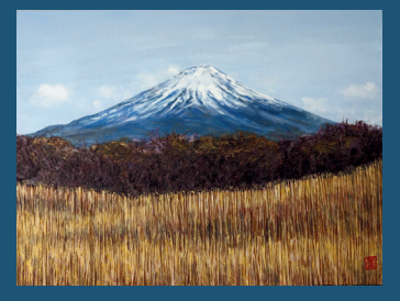
Mt. Fuji from Asagiri Kogen