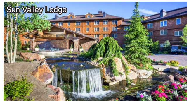
Sun Valley Lodge