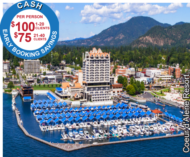
Coeur d'Alene Resort