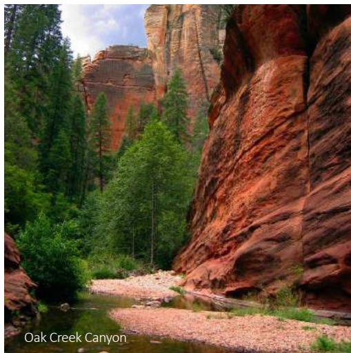
Oak Creek Canyon